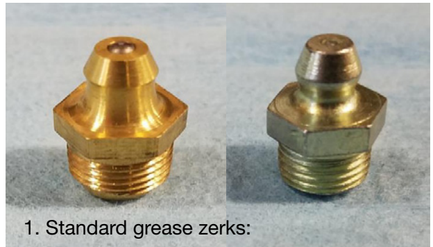
1. Standard grease zerks:

Best Regards, The Silverthin Bearing Group