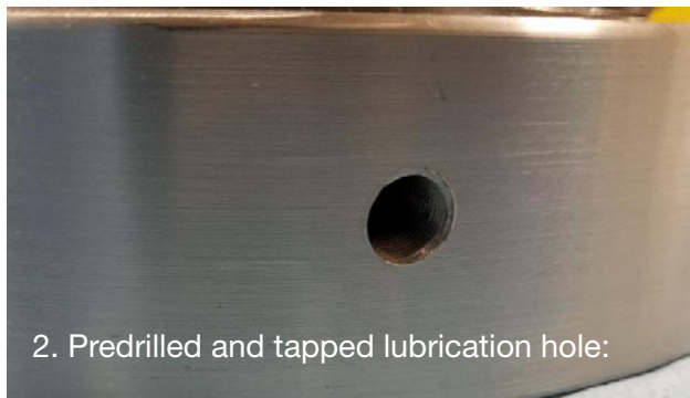
2. Predrilled and tapped lubrication hole: