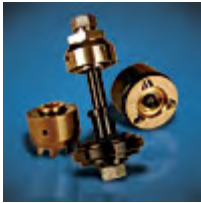
Bearing Staking, Removal, and Testing