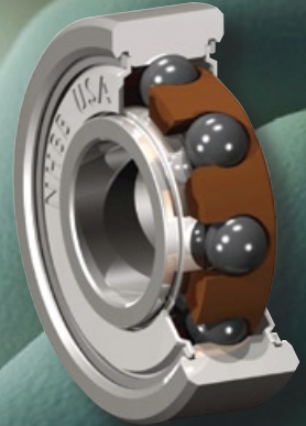
Unflanged Shielded (Machined Crown)